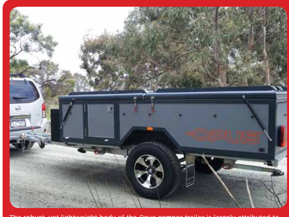
The robust, yet lightweight body of the Opus camper trailer is largely attributed to its composite sandwich panel construction. These dynamic sandwich panel walls are comprised of alternating layers of aluminium and ply with an insulated core to deliver top-notch structural rigidity and a resistance to impact and harsh weather.

From low profile to high-class in only a matter of minutes, the simple-to-setup Opus camper trailer makes it easy for you to enjoy extended stays at a single location or quick overnight stops as you go. With stabilising legs designed to wind down quickly and a folding tent section that assembles smoothly, you'll be free to spend more time enjoying the perks of your campsite and less effort making it ready.