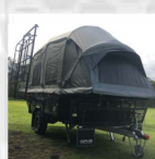
Roof rack set up