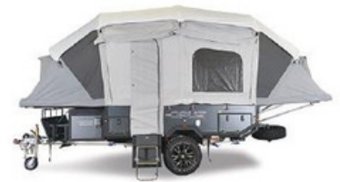
Aerial view with annexe & roof rack installed